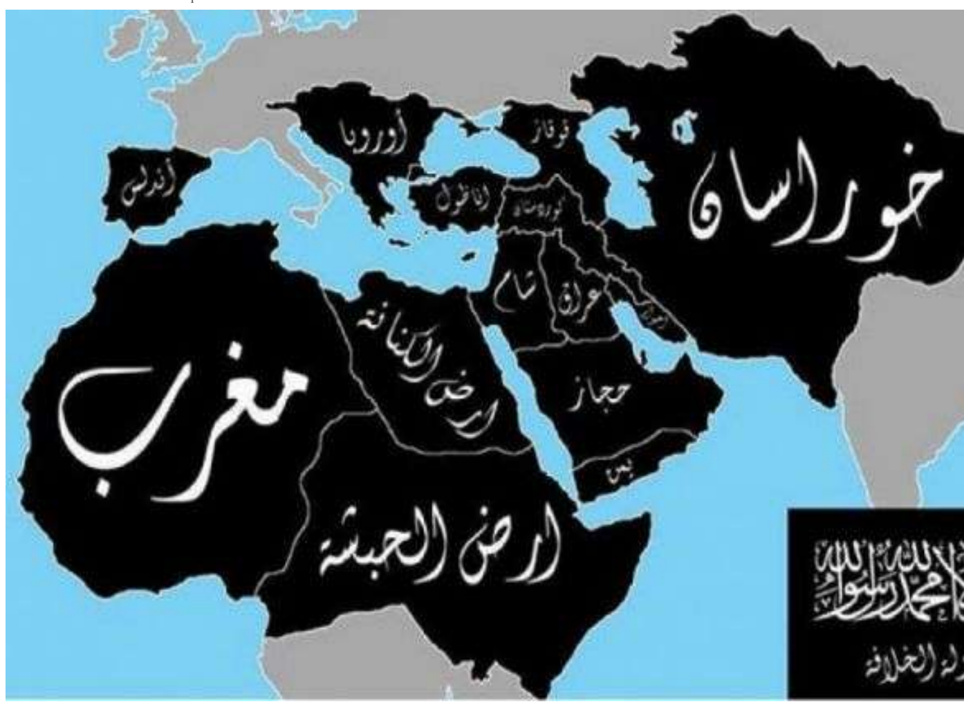
Here's the Islamic version of the map:

The confederacy of nations that this map shows us (minus the non-Muslim lands) is what Sheikh Yusuf al-Qaradawi, the highest leader in the Muslim Brotherhood, generally announced in Istanbul back in August. He also rebuked the current ISIS caliphate saying it doesn't meet the conditions required to be a caliphate.